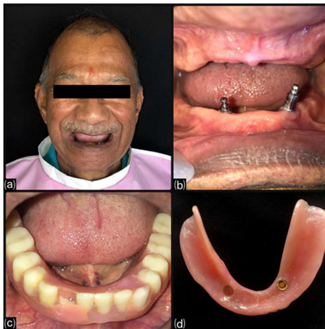
Figure 1 (a) Extra Oral Image, (b) Intra Oral Image, (c) Prefabricated Dentures (Occlusal View), (d) Prefabricated Dentures (Intaglio View)