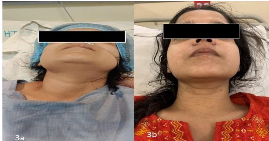
Figure 3a & b taken on day 5 and day 10 after onset of Ludwig's angina showing drastic improvement in swelling.

medical management and swelling reduced drastically within 5 days (Figure 3a& b). She was discharged in a vitally stable state on 17 th day of hospitalisation.