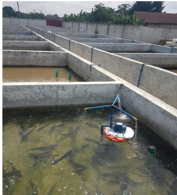
Figure 1. Testing the sprinkler aerator