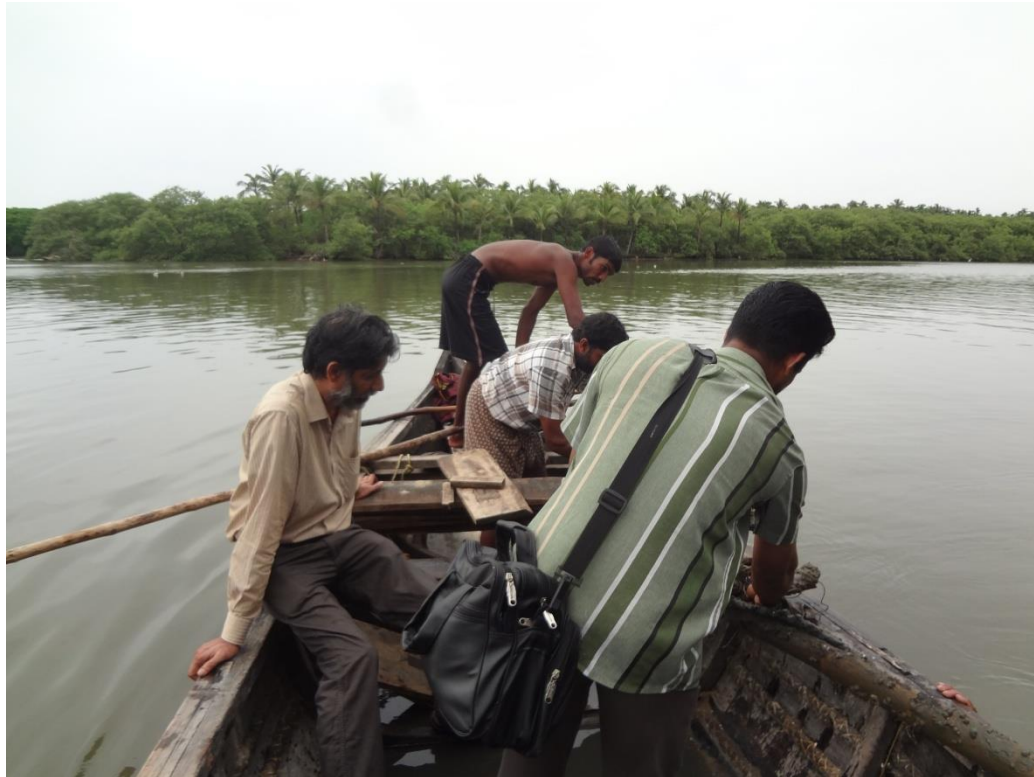
Photograph 10 Monitoring of the site by the project team