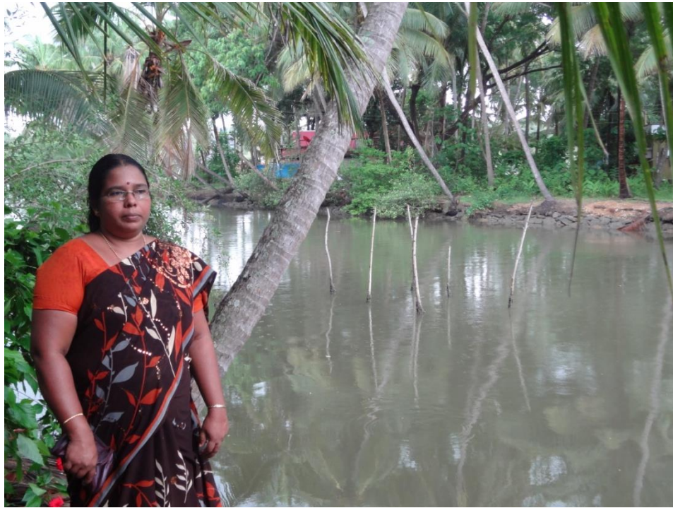
Photograph 9 SHG leader at the mussel culture site