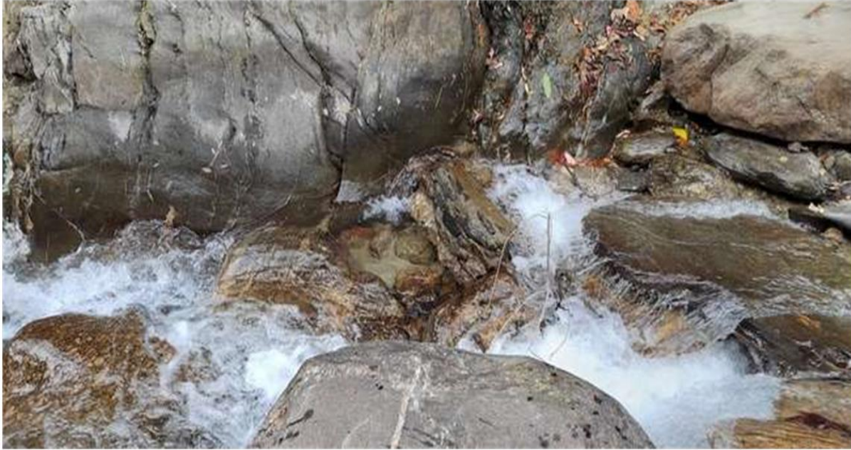
Figure 5 Type locality of Garra phewakholaensis sp. nov., Mangsebung Rural Municipality, Ilam, Nepal.