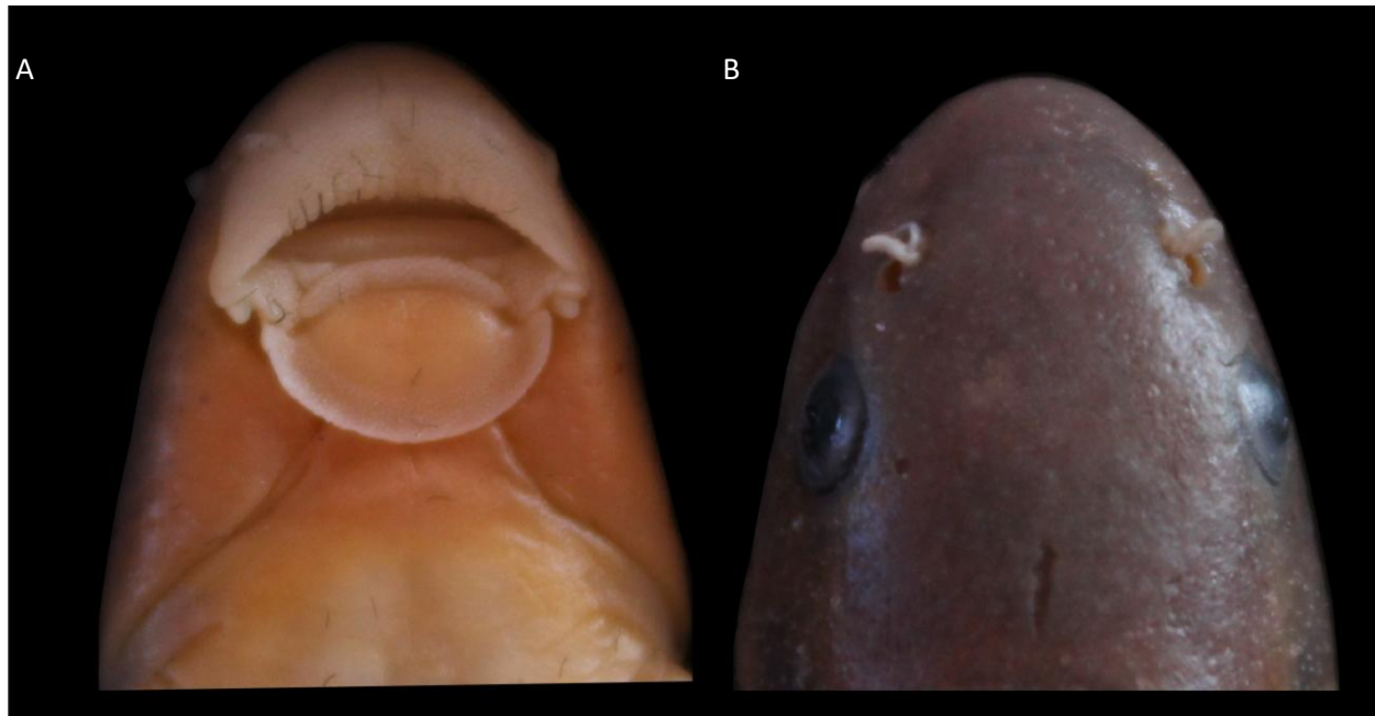
Figure 3 G. phewakholaensis ; BRCC 30201, holotype, 69.5 mm SL, A, mental adhesive disc and B, dorsal of head.

Its second unbranched ray is the longest (84% of dorsal fin depth); length of first branched ray 74.5% of dorsal fin depth; second branched ray much shorter 59.7% of the dorsal fin depth. Pelvic fin with single unbranched and 7 branched rays, long axillary scale at the base of pelvic fin. Pectoral fin with single unbranched ray and 12–13 branched rays, caudal fin forked with 19 principle rays; tips of lobes slightly pointed. Caudal peduncle almost twice as long as its minimal depth. Number of scales in between pectoral and pelvic fin 12. Anal fin with single unbranched and 5 branched rays. Number of scales in between anal fin origin and anus 3 or 4. Scales on dorsal fin base 5. Lateral line complete, running along midline of body, lateral line scales 35–36. Predorsal scales 11; regularly arranged; same size as flank scales, but smaller than belly scales; chest and belly scaled, scales deeply embedded on chest. Transverse scales above lateral line 4. Circumpeduncular scales 14. Total vertebrae 33.