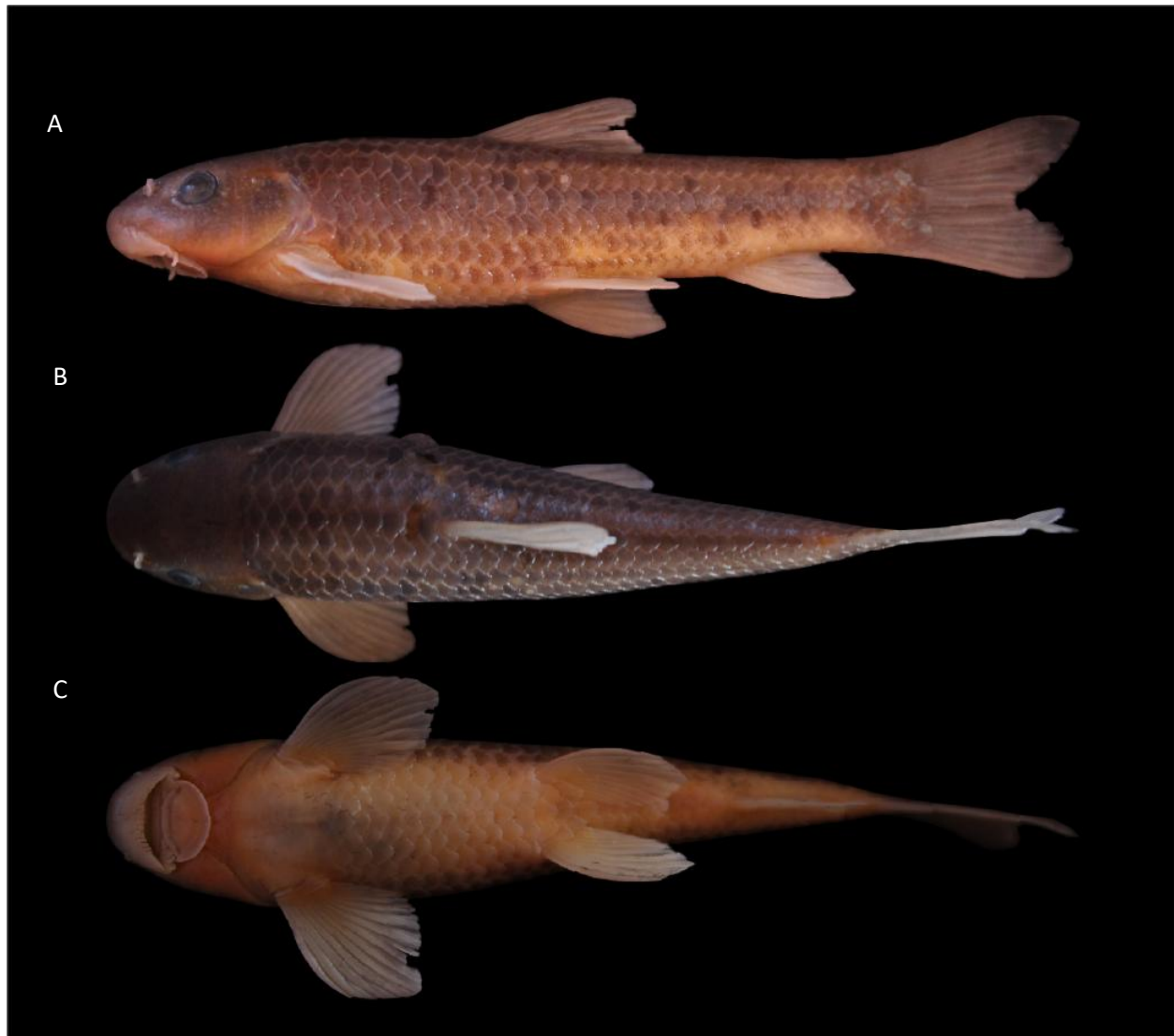
Figure 2 Garra phewakholaensis sp. nov., BRCC 30201, holotype, 69.5 mm SL; Nepal: Ilam, Phewakhola stream (A, Lateral, B, dorsal and C, ventral views).