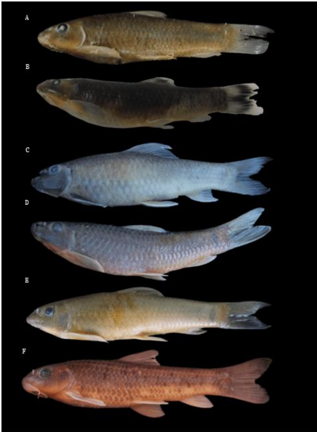
Figure 4 List of Nepalese Garra species: (A) G. annandalei , (B) G. lissorhynchus , (C) G. gotyla , (D) G. nasuta , (E) G. kempi , (F) G. phewakholaensis sp. nov.