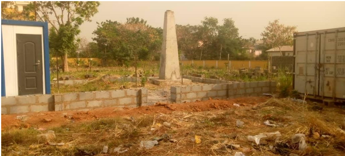
Figure 3: The COR Station in NASRDA, Lugbe in Abuja

Lugbe, Abuja falls under the jurisdiction of the Abuja Municipal Area Council (AMAC). It's a predominantly residential area within AMAC, one of the six area councils that make up the Federal Capital Territory (FCT); (Fig. 3).