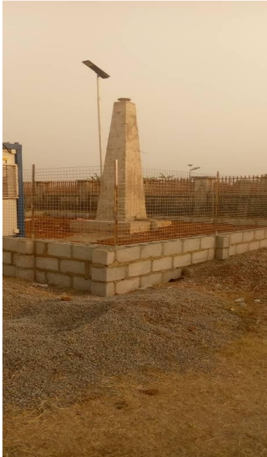
Figure 2: The COR Station, in Mpape in FCT.

Elhassan (2017), used an RTK technique to evaluate the horizontal positioning accuracy of Real Time kinematic Global Positioning System (RTK-GPS) available at the surveying engineering program laboratory of the civil engineering department, King Saud University. The results show that a horizontal positional root mean squared Error of 11mm can be obtained using the Leica SR 530 RTK-GPS.