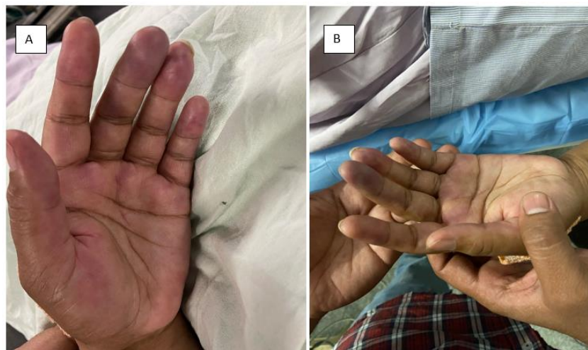
Figure 3 (A) Changes due to limb ischemia before and (B) Showing changes post ganglion is block changes