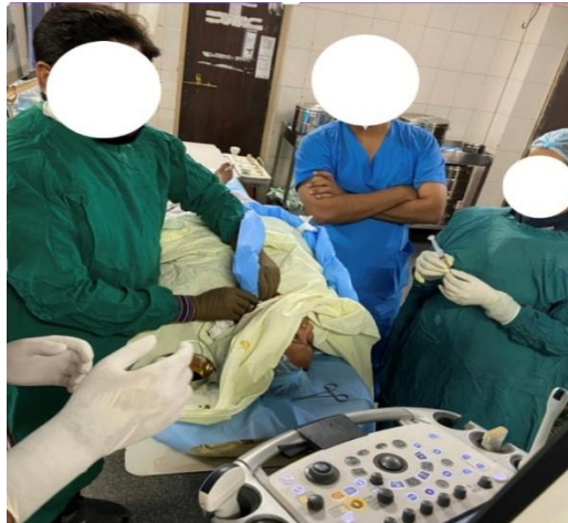
Figure 1 USG guided stellate ganglion block.

down gradually. Score on pain detect tool was 5, on day 15 (NRS1/10), day 30(NRS1/10) at 3months (NRS 1/10) and at 6months (NRS2/10). As a result, effective and long-lasting pain relief is provided.