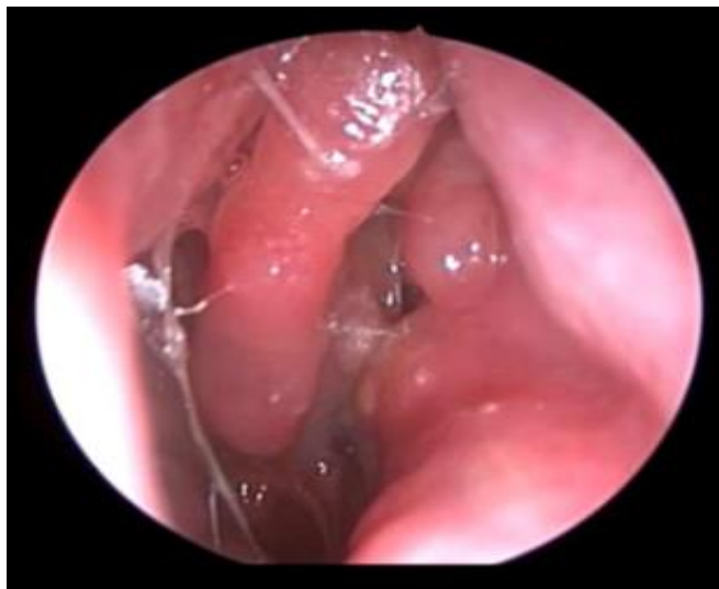
Figure 3 Rhinoscopy of one side of the nose after 1year post FESS