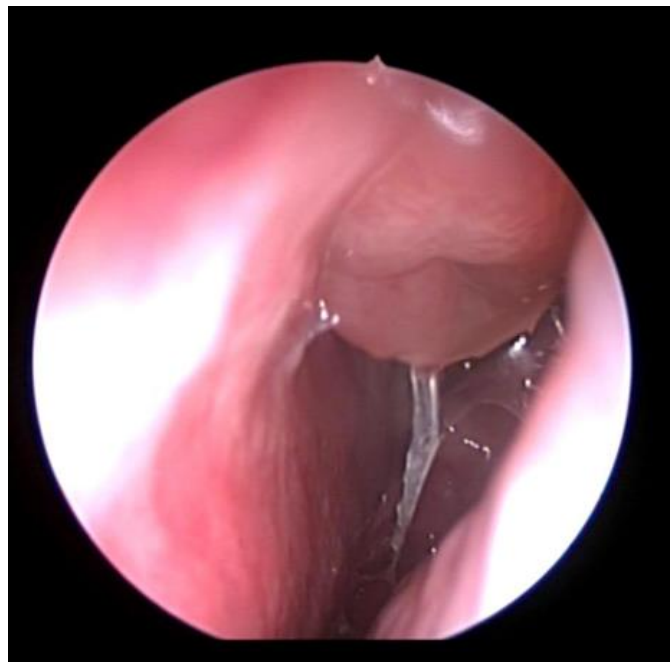
Figure 4 Rhinoscopy of the other side of the nose after 1year post FESS