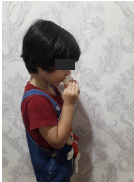
Figure 1 collecting non-stimulated saliva one hour after eating and brushing