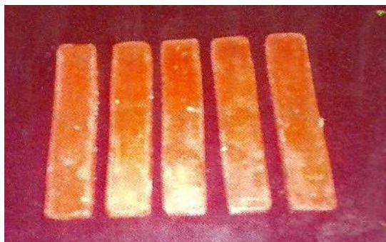
Figure 2 Wax Blocks