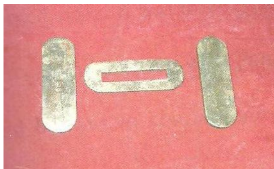
Figure 1 Master Die

Modeling wax (No. 2, Hindustan Dental Products Limited) was melted and poured in the die space, until it was in level with the edges of die space. Once it had solidified and cooled to room temperature, the wax pattern was removed carefully from the die space (Figure 2).