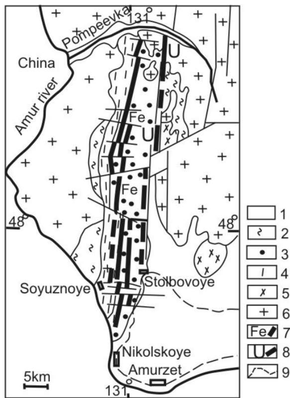
Figure 1 The position of the ore-bearing graben in the geologic structure of the region (Chebotarev, 1958; Zhirnov, 2008; Zhirnov, et al., 2012). 1 – Neogene-Quaternary loose rocks; 2 – clay shales, sandstone, and dolomites ( \epsilon_1 ); 3 – dolomites and schists (V) of the Murandava Formation; 4 – coaly clay shales of the Igincha Formation (R); 5 – Lower Proterozoic metamorphic rocks; 6 – Paleozoic granitoids; 7 – iron ore zones; 8 - gold-uranium-vanadium zone (U); 9 – ground type highways.

The ore field consists of two main meridionally-striking parallel ore zones 60 km long, separated from one another by 5-7 km, in the side parts of the graben (Figure 1). 90% of each ore body is ferruginous ores. The manganese stratum occupies the marginal position in the lying side of the ore bodies.