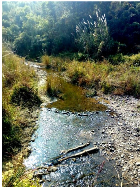
Figure 4 Type locality of Paracanthocobitis tumitensis sp. nov., Tumat River, Purum Chumbang Village, Chandel district, Manipur, India.

The species inhabits flowing clear water with gravel bottom and lush green algal bloom (Fig. 4). They were found adhering to rocks at the time of collection and associated with Devario , Schistura , Mastacembelus , Pethia and Opsarius species.