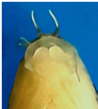
Figure 2 Oromandibular structure of Paracanthocobitis tumitensis sp. nov.

Lateral line incomplete, reaching at most to dorsal-fin insertion, 28-33 pores. Axillary pelvic lobe absent. Mouth arched with papillated lips; upper lips with 2-3 minute rows of papillae, discontinuous with large pads on lower lip. Three pairs of barbels, inner rostral barbel extends to or slightly past base of maxillary barbel, maxillary barbel and outer rostral barbel extend to or slightly past orbit or eye. Body covered with scales, 10½ branched dorsal-fin rays; 11-12½ pectoral-fin rays and pointed or acuminate, 9 pelvic-fin rays and rounded to subacuminate, 7 branched anal-fin rays; 18 branched caudal-fin rays.