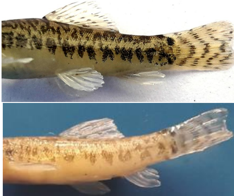
Figure 3 Colour pattern on side of body in Paracanthocobitis tumitensis sp. nov.

Body brown to greyish with 15-16 dark brown to black scattered blotches along lateral line and not extending onto lower side of body, 15-17 dark brown scattered dorsal saddles. Dark spots and blotches on head; 1 uninterrupted black bar from anterior eye to tip of snout, and 1 interrupted black bar from the tip of snout to the posterior end of eye which lower surface of eye i.e., in infraorbital region. 2 black ocellus like spots at the upper and lower portions or bases of the caudal-fin origin. Dorsal-fin with 3-4 black dotted rows of bands.