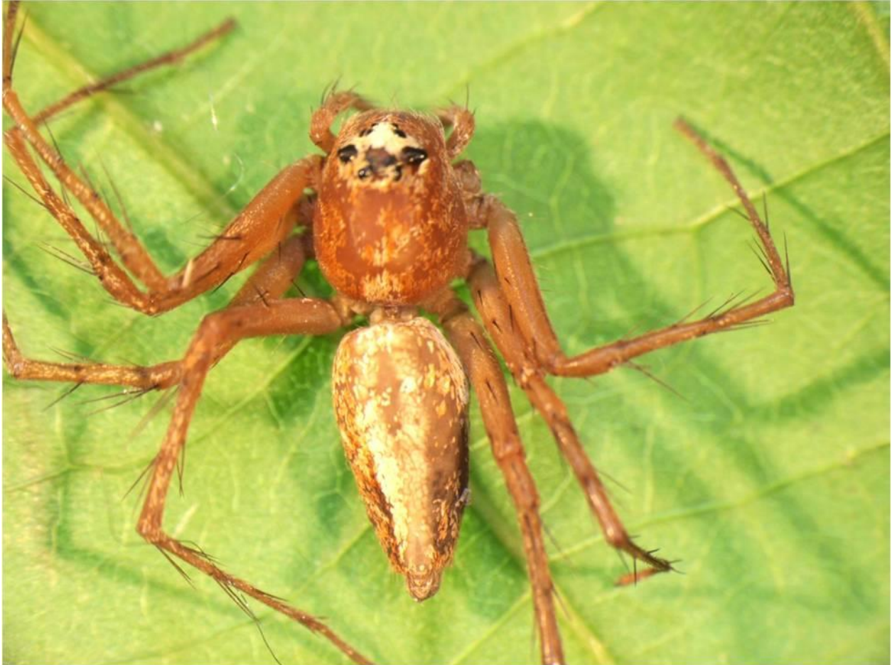
Figure 6 Photographic Image: General Habitus.